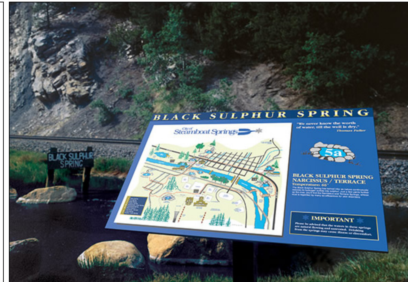
F Environmental Signage