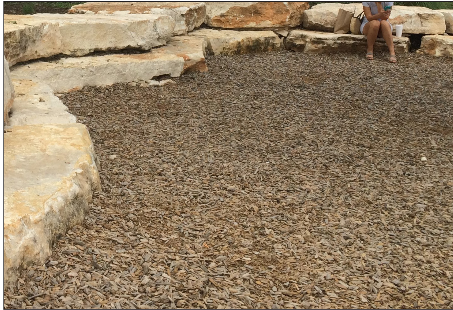
C Natural Experience Area - Surface 12" Mulch