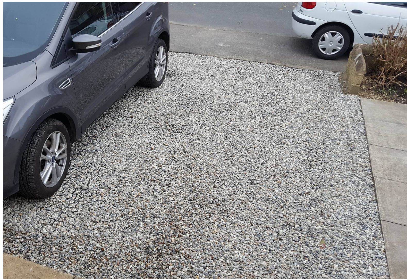
D Aggregate Parking