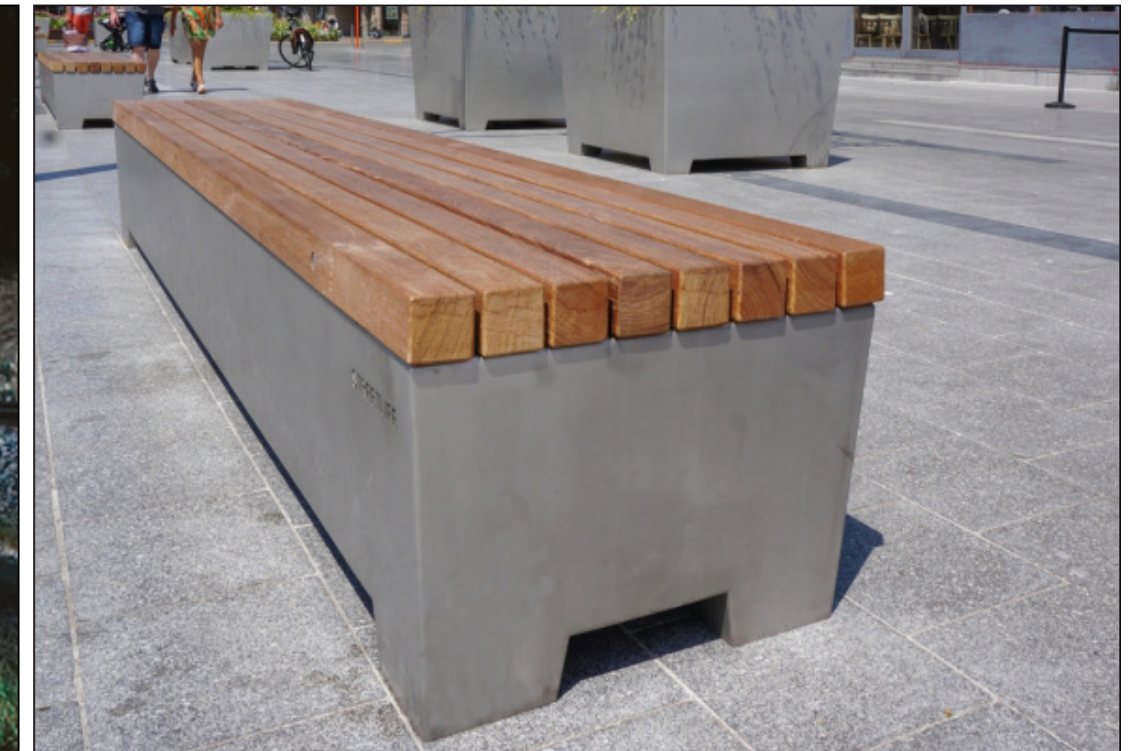
G Wood Bench