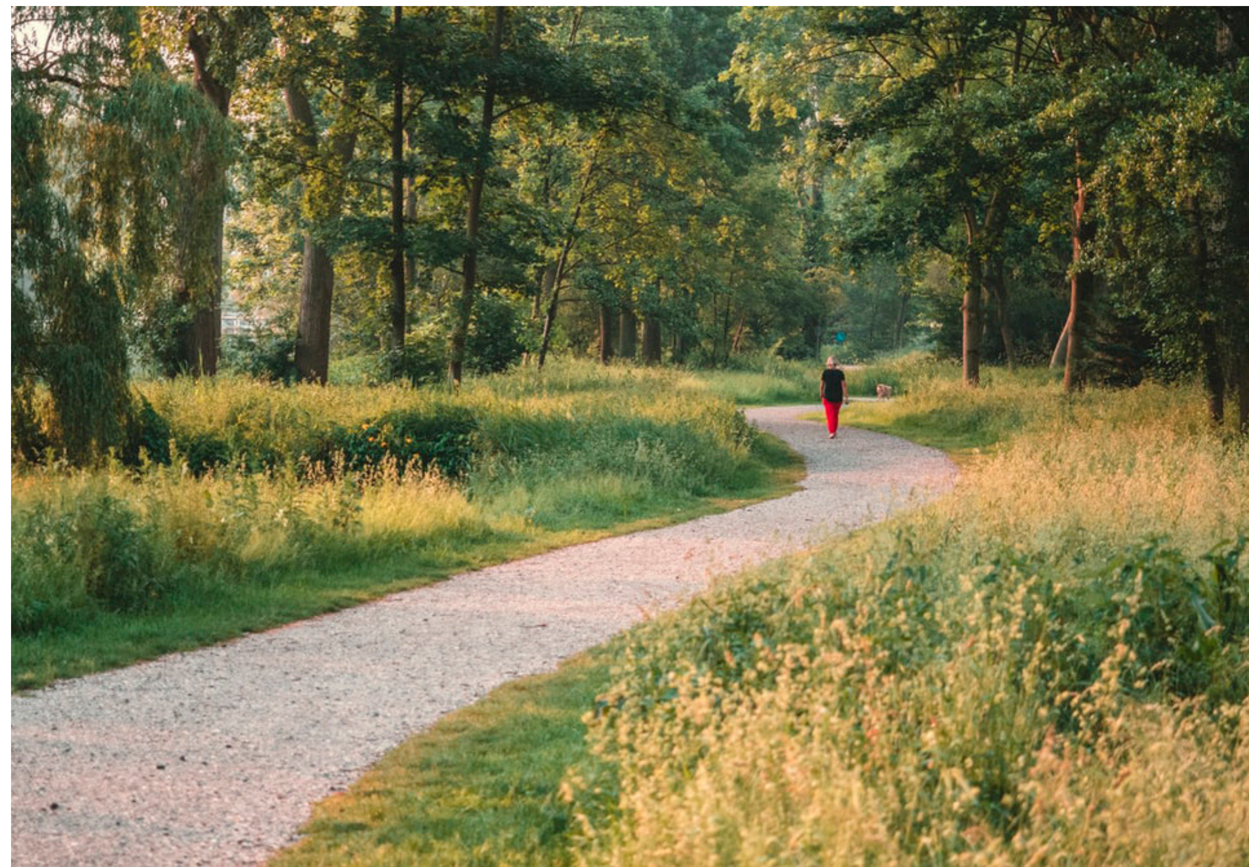
A 8' Trail - Off Street (Mulch)