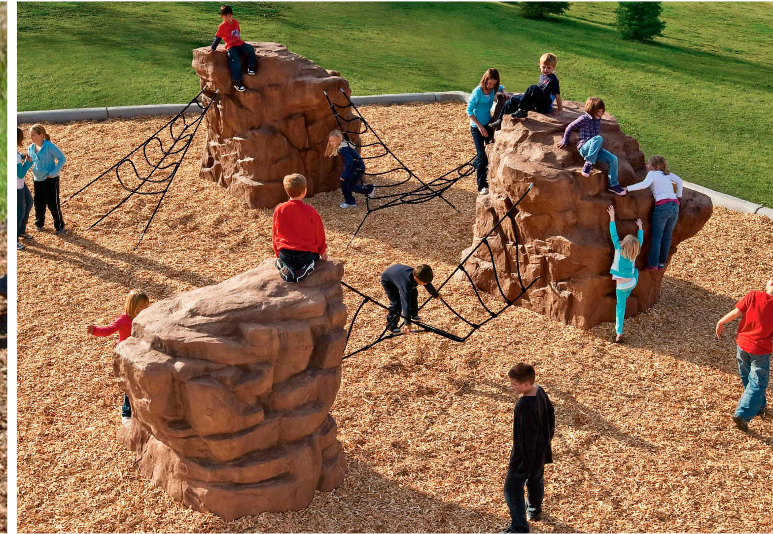
Natural Experience Area - Climbing Boulder