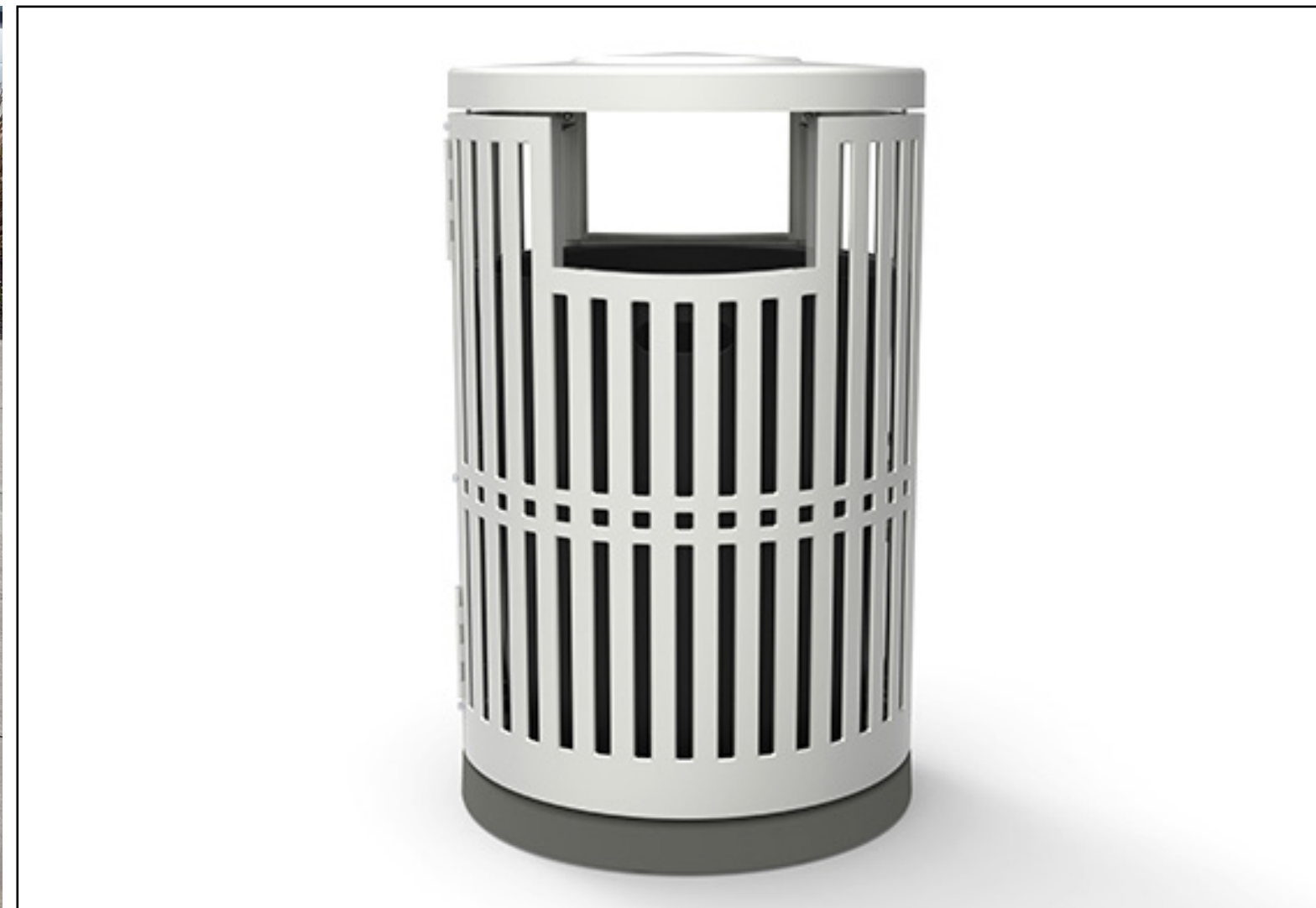
E Trash Receptacle