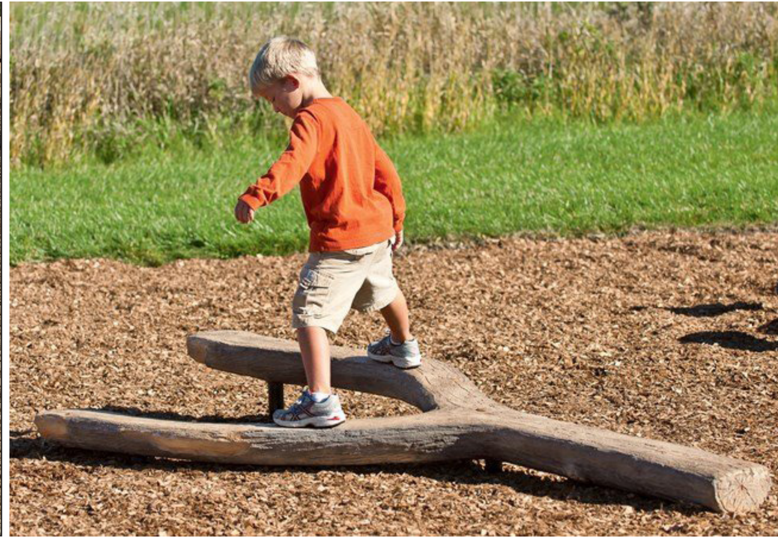
Natural Experience Area - Log Balance