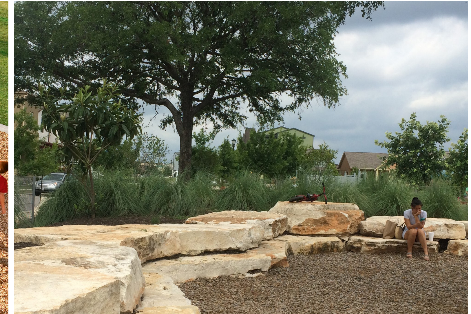
Natural Experience Area - Boulder Seating